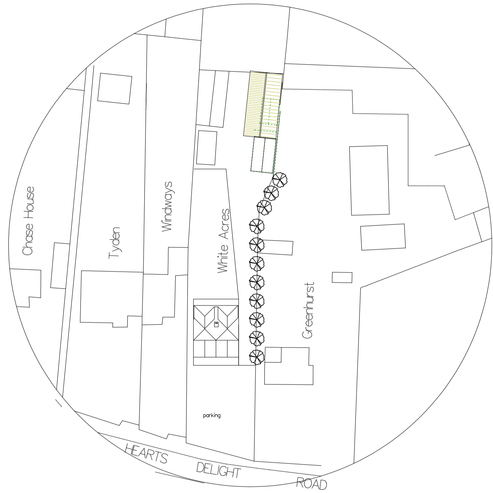
proposed site plan